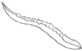
Agave sap / Aguamiel